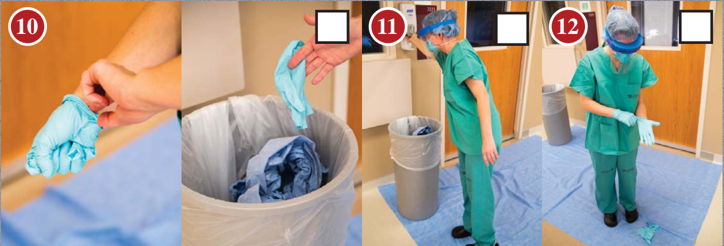
⑩ Remove the inner standard patient care gloves using glove-in-glove technique and place them in the trash. ⑪ Perform hand hygiene, but do not leave the doffing pad (use available hand sanitizer). ⑫ Apply new clean gloves from the doffing pad.