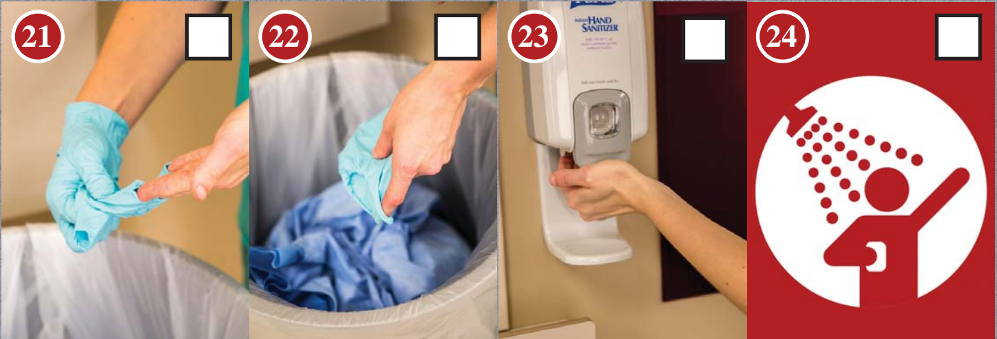
21 Remove the standard patient care gloves using glove-in-glove technique. 22 Place gloves in trash. 23 Perform hand hygiene. 24 Proceed to Shower.